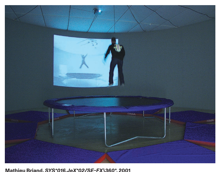
Matthed Briand, 57S 076.36A 02/3E-FA (360 , 2001) MacLYON collection Photo: Blaise Adilon © Adagp, Paris, 2024

The interactive installation Nosukaay , 2022, is conceived as an early attempt at a textile machine, a hybrid between a West African loom and a computer. The artist has replaced the two traditional frames of a Manjak loom with two screens. When the visitor touches the fabric, it transmits information enabling them to enter into the story of a video game.