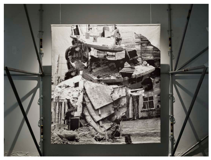
Ailbhe Ní Bhriain, Intrusion I, 2022 macLYON collection Courtesy of the artist and domobaal gallery, Londres Photo: François Deladerrière

Consisting of collages of digital images translated into Jacquard weave tapestries, the works in the series Intrusions , 2022, blend landscapes of architectural ruins with animal and human forms that seem poised to disappear. Taken together, they conjure up an enigmatic environment that reflects the uncertainty, the contradictions and the vulnerability of the world we live in.