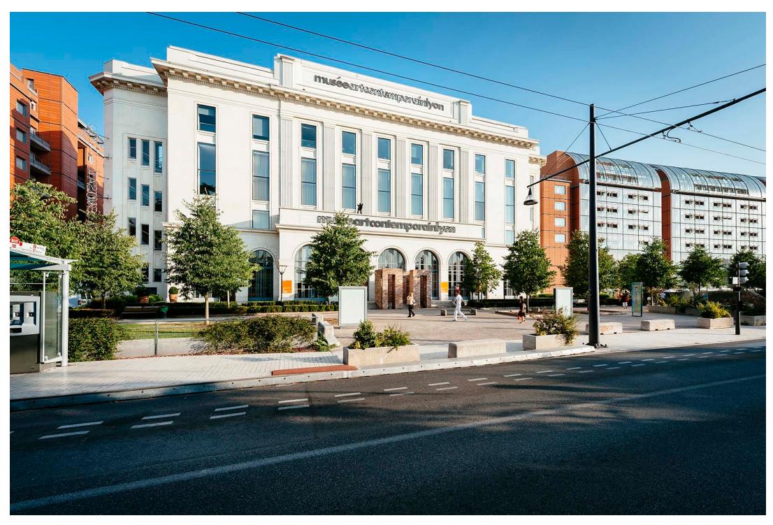
View of the Musée d'art contemporain de Lyon

The two collections of the Musée des Beaux-arts and the Musée d'art contemporain de Lyon were brought together in 2018 under the aegis of an Arts Pole to form an exceptional ensemble on the French and international art scenes.