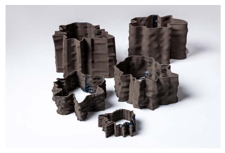
Justine Emard, Dreamprints (detail), 2021

The exhibition Univers Programmés presents three works by KOLKOZ from the macLYON collection. The installation Half Life <sup>2</sup>, 2001-2002, takes visitors on a virtual journey through a video game that uses the scenography of the exhibition as its setting. The other two works are strange, grey, geometrically shaped models of living rooms in which the artists show their holiday films.