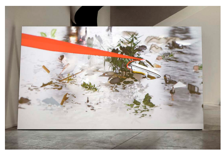
lan Cheng, Thousand Islands Thousand Laws, 2013 macLYON collection View of the 13th Biennial of contemporary art at Lyon [Entre-temps... Brusquement, Et ensuite – presented from 12 September 2013 to 5 January 2014

For Thousand Islands Thousand Laws, 2013, Ian Cheng created an algorithm that generated ad infinitum forms in a digital environment: an island with more or less fuzzy vegetation, inhabited by a soldier and a few herons. The forms appear and disappear autonomously and randomly, beyond either the artist's or the viewer's control.