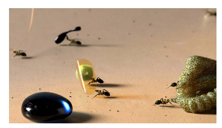
Wang & Söderström, Rehousing Technosphere, 2022 3D animation, sound Duration: 5'41"