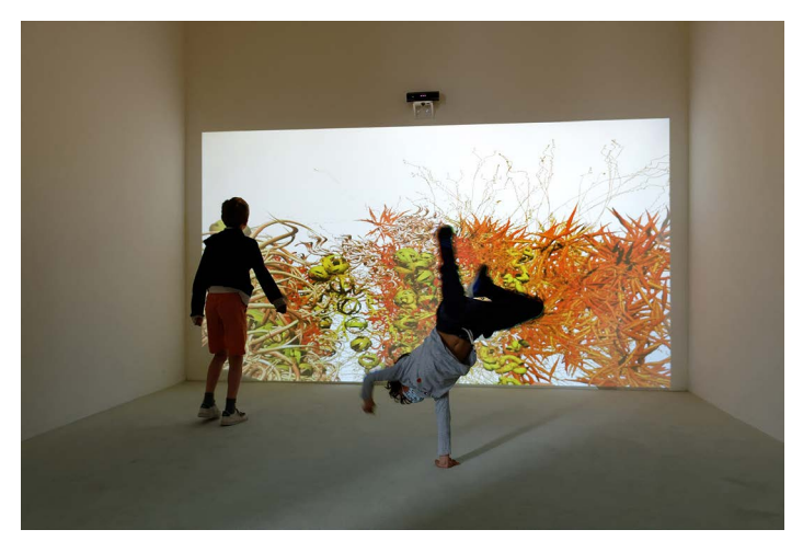
Christa Sommerer et Laurent Mignonneau, Intro-Act, 1995 Producted for the Biennale de Lyon 1995 macLYON collection

The interactive work Intro-Act , 1995, duplicates the visitor's image on a screen where each of their gestures generates constellations of plant and mineral forms that end up completely filling the virtual space.