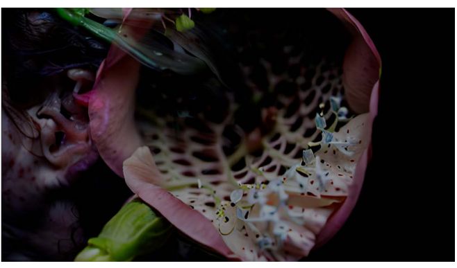
Léa Collet, Digitalis, 2024 Produced by Le Fresnoy with the support of the Neuflize OBC Foundation