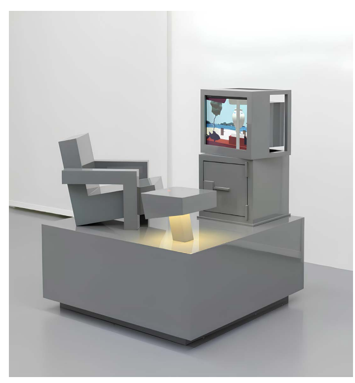
KOLKOZ, Film de vacances, Hong Kong, 2016 macLYON collection