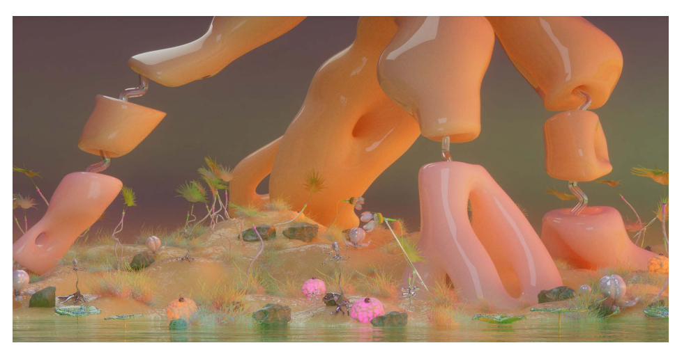
Bianca Shonee Arroyo-Kreimes, The Pond (détail), 2023 Installation multimédia 3D