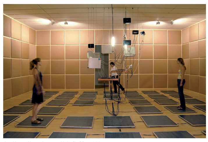
Jan Kopp, News from an Unbuilt City , 1998 National Contemporary Art Funds, transfer to the Musée d'art contemporain de Lyon in 2007 Photo: Blaise Adilon © Adagp, Paris, 2024

The installation News from an Unbuilt City, 1998, reveals the sounds of an imaginary city. As visitors wander around the installation, sensor plates placed on the floor react to their steps, triggering sounds pre-recorded by the artist – excerpts from conversations, traffic noise and popular songs.