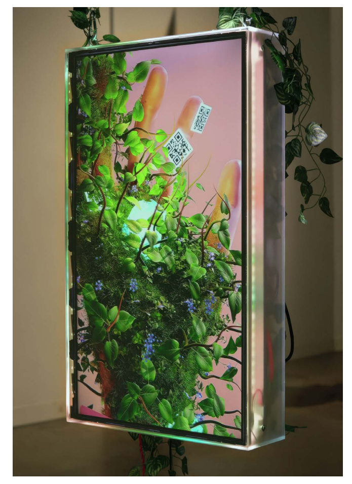
Baron Lanteigne, Nature morte 7 (detail), 2022 Eastern Bloc at Monteal

For Univers Programm és, the artist is exhibiting Nature Morte 7, 2022, an installation composed of a single, but fragmented, window of screens on the floor, displaying computer-generated images of a forgotten world. These are overlaid by colourful vegetation interwoven with QR codes and electrical wires. Overhanging this carpet of screens, a suspended sculpture reveals the complex network of components and electronics required for it to function.