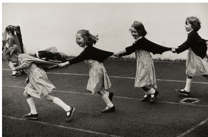
Markéta Luskáčová, Children in Playground IV, London , 1988 Silver print 40 x 50,5 cm British Council Collection Courtesy of the artist © Adagp, Paris, 2023