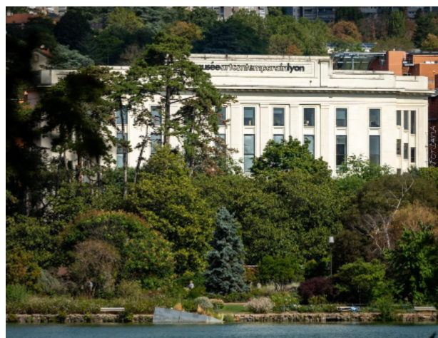
View of the macLYON

Its collection includes over 1,600 works. Anchored in the actuality of the visual arts, the collection presents a great variety of forms, materials and dimensions: performance, painting, video installation, sculpture, sound installation, photography, drawing, cinema, computer programming and books. It is characterized by a large proportion of monumental installations, indicative of art's evolution towards the creation of immersive worlds, which can be directly experienced by the visitor. A selection of these is shown in rotation at the macLYON as well as in several partner structures. Works of its collection are regularly loaned for exhibitions in France and all over the world. It consists mainly of monumental works and ensembles of works, dating from the 1940s to the current day, created by artists from all over the world, the majority for exhibitions at the museum or for the Biennales d'art contemporain de Lyon whose artistic direction is assured by the director of the macLYON. Brought together in an arts pole with the Musée des Beaux-Arts since 2018, the two collections form a remarkable ensemble, both in France and in Europe.