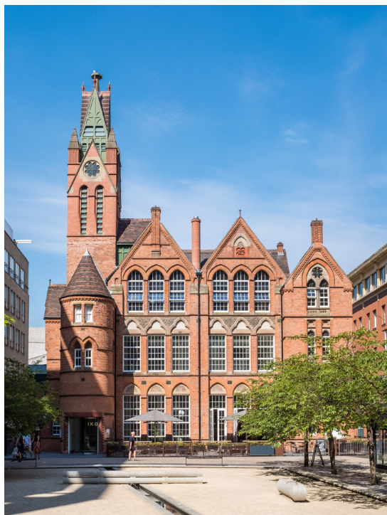
View of the Ikon Gallery