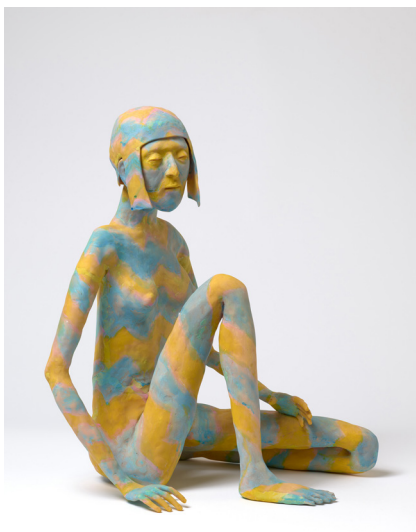
Francis Upritchard, Marianne , 2016 Steel and foil armature, paint, modelling material, paper mache 55 x 38 x 47 cm British Council Collection