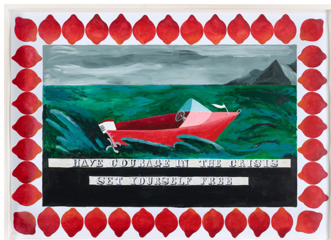
Lubaina Himid, Have Courage in The Crisis Set Yourself Free , 2016 Acrylic on paper 72 x 102 cm British Council Collection