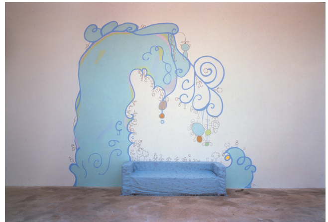
Lily van der Stokker, Nice and Easy , 2002 Installation, wall painting and sofa covered with an embroidered slipcover, acrylic paint, synthetic foam, fabric and medium 375 x 426 x 79 cm Deposit by the CNAP at the Musée d'art contemporain de Lyon since 6 October, 2004