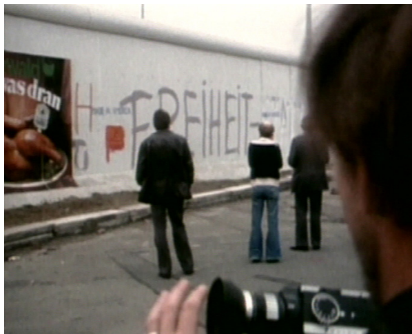
Gordon Matta-Clark, The Wall, 1976-2007 Coloured video, sound Duration: 15'04" macLYON collection - Inv.: 2008.2.3.14