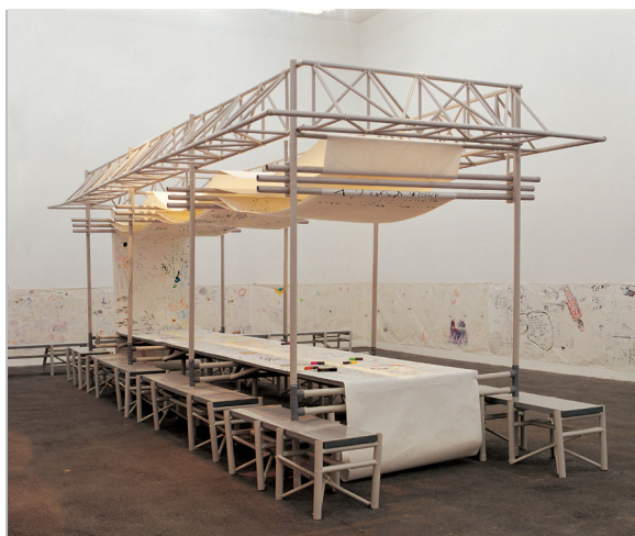
Niek van de Steeg, Structure de correction, table de débat , circa 2000 View of the exhibition Structure de correction – Toc mural de Niek van de Steeg et Géraldine Pastor Lloret , Crac Occitanie, 2004 Installation - 300 × 280 × 960 cm Collection of the artist Deposit by the artist at the Musée d'art contemporain de Lyon since 8 June, 2009