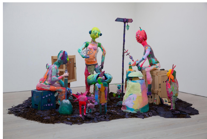
Luke Routledge, The Apple, the Egg & the Butterfly , Studio Response 2, 2022 Mixed media Variable dimensions

Echoing Fabien Verschaere's 60 drawings for Seven Days Hotel , a major work in the macLYON collection, Luke Routledge presents a series of sculptures evoking imagination and friendship.