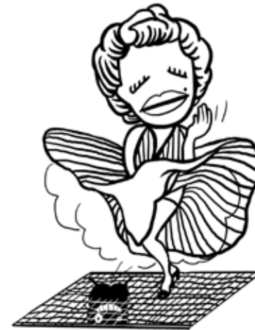
Sheng Scott Assball Animation Series , 2007 Digital painting on canvas 39.5x30 cm Courtesy Shanghai Art Museum