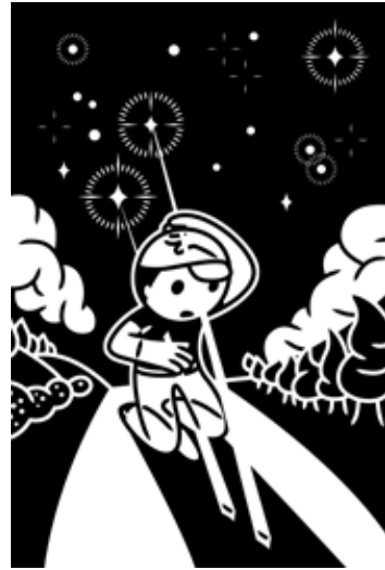
Tang Yan Meteor , 2005–2006 Installation, video animation and objects 5'00" Collection of the artist

These works epitomise the “gelatin culture” of the major cities that now dominate China. The artists grew up in a highly labile society; and their motley, childlike world