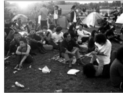
Wen Ling Ziboy.com , current project Photograph, 15x20 cm