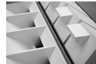
Meng Jin Corner Rooms , 2005 Sculpture, 180x50x43 cm