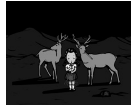
Bu Hua Anxiety , 2009 Video animation, 3'25" Collection of the artist