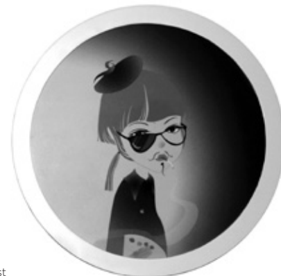
Chen Yun Who Am I? , 2008 Digital painting Diameter 44 cm Collection of the artist