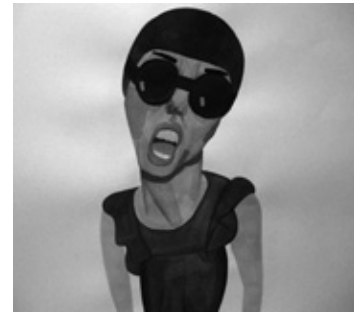
Hu Zi Number 4 , 2009 Gouache on paper, 35x45 cm Collection of the artist