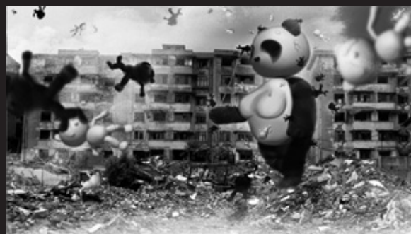
Temporary Panda Study Group (Lin Zero, Song Phatter, Huang Hot, Giong Lim) Repanda Reb-Earth , 2009 Video animation, 8'02" Collection des artistes