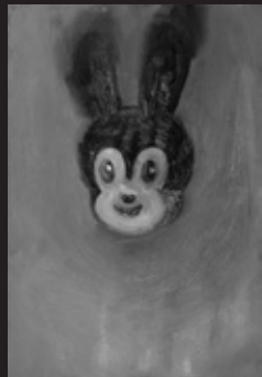
Zhang Ye Grumble , 2007 Mixed media on canvas 30x20,5 cm

/... THEY BRING THEIR MEANDERING IMAGINATION TO A WORLD OF GLAMOUR, KITSCH, DESIGN, SHOW BIZ. EXTRATERRESTRIALS, WHETHER FROM MYTHS OR MANGA CARTOONS, OCCUPY THEIR VISIONS OF THE FUTURE. / ZHANG QING